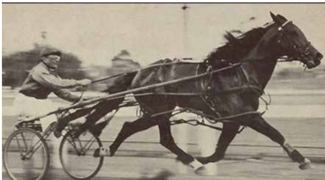
Noble Scott's son James Scott.