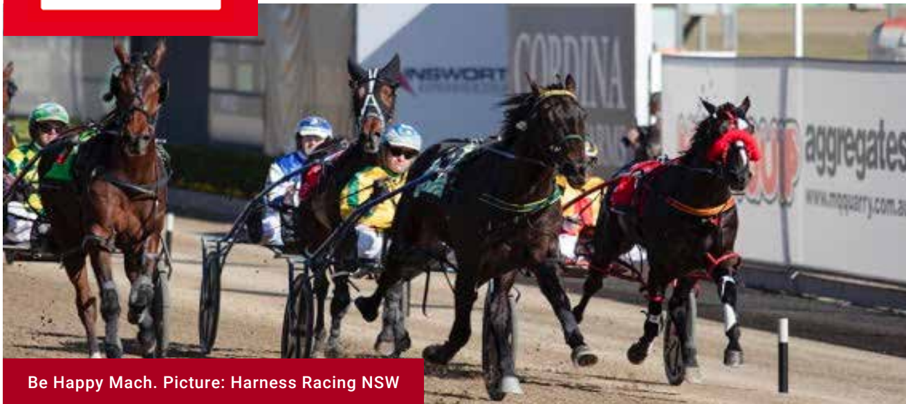
Be Happy Mach.