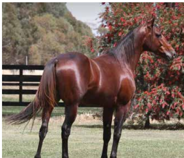
Always B Miki

LOT 207: Sportswriter US-Rooftop Fair. Full brother to group 1 winner Our Uncle Sam.