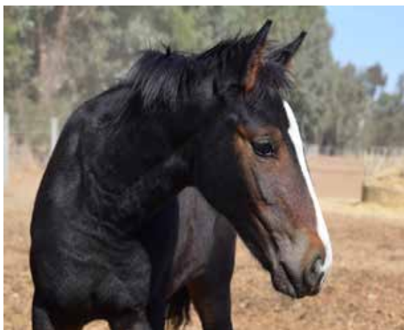
Cover: Follow a Foal "Demi" Aldebaran Eagle US-Aldebaran Maori filly