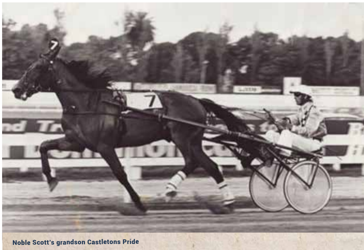
Noble Scott's grandson Castletons Pride