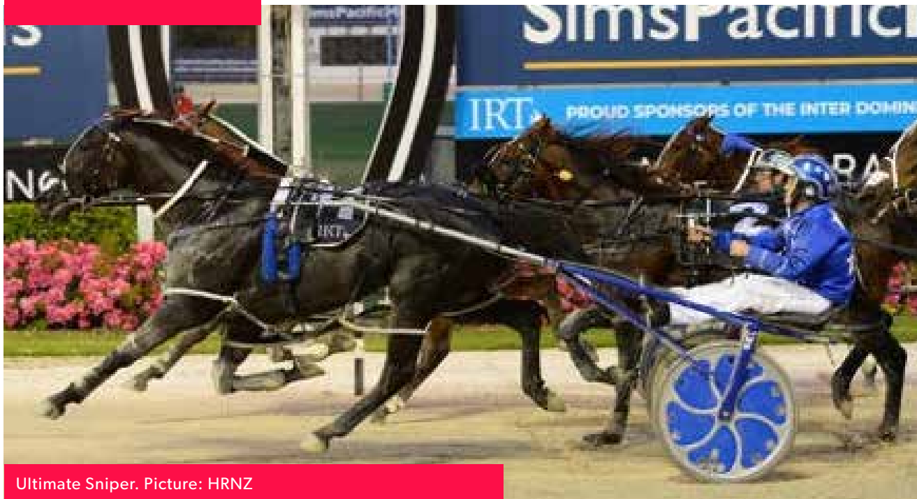
Ultimate Sniper.