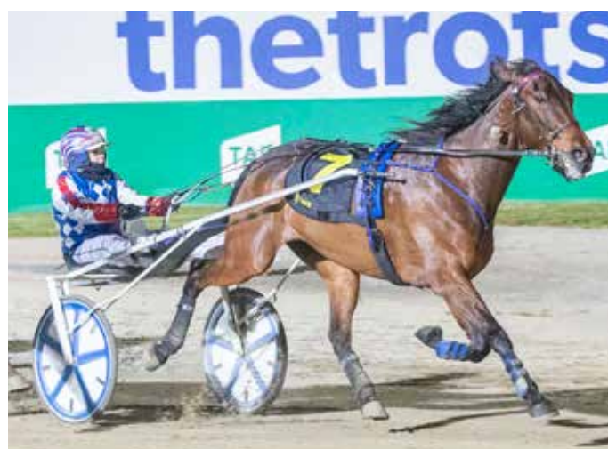
Tornado Valley.

Mary Clare is a daughter of Keystone Crosby US and Idol Clare (Maori's Idol), which was out of top flight trotting mare Downsouth Clare (Caliburn US-Lucy Clare). Downsouth Clare won 19 races for $101,000, including the 1983 Australasian Trotting